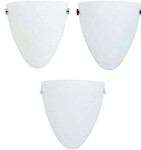
WSC26 Wall Sconce