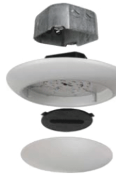
J Box Installation